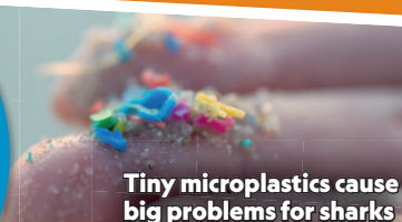
Tiny microplastics cause big problems for sharks