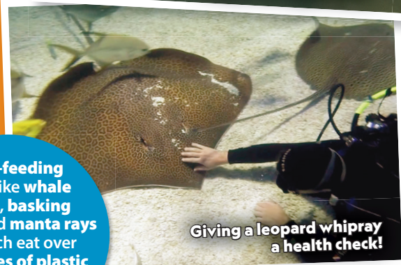
Giving a leopard whipray a health check!